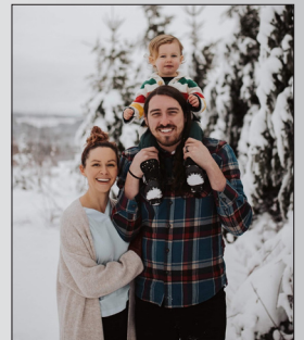
Solstice Supply and Design

We have a great selection of men's, women's, and children's clothing to keep you looking fresh on the slopes, while catching waves, or just hanging out! We hope you'll swing by and check us out!